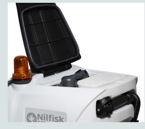
Easy to clean with recovery tank lid completely removable.