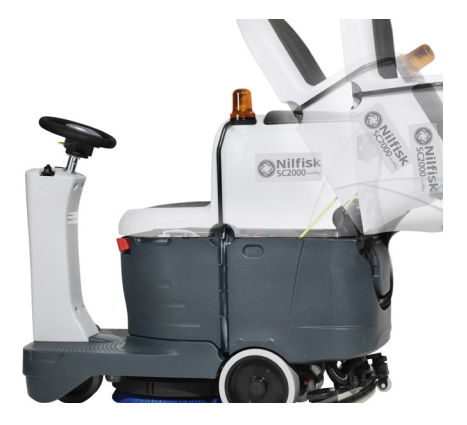
Recovery tank fully tiltable gives easy access to battery compartment and Ecoflex system