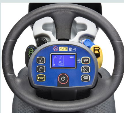
Easy to control: Extremely user friendly and easy to learn. Dashboard with One-Touch button and intuitive display integrated in the steering wheel