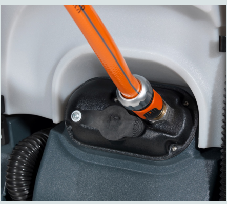
Filling system with automatic shut off when tank is full (optional)