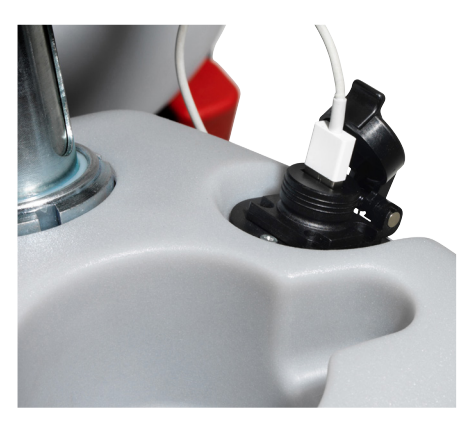
USB port as optional